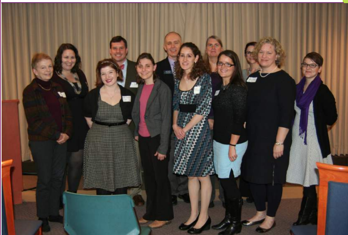
New Sigma Chapter initiates and chapter leadership